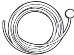
2 x Cable