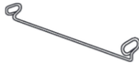
2 x Wire Spacer