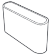
12 x Sleeve